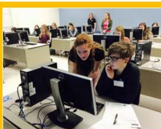
Students at the 4-H Academy and World Food Prize Youth Institute learn about professional communication at Purdue University.

The table of contents will introduce various subjects that are important for our youth to understand. It will have an emphasis on democracy in the news and media world: